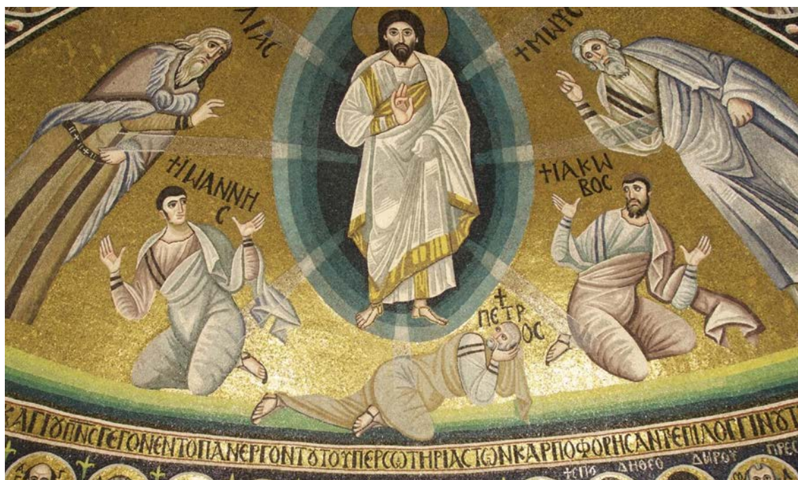
Transfiguration Mosaic – St. Catherine's Monastery, Sinai, Egypt

February 14, 2021 – 9:30 AM The Holy Eucharist – Contemporary Service