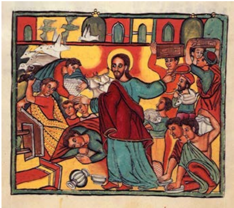
Jesus Cleansing the Temple – 17 th c. Ethiopian

March 7, 2021 – 9:30 AM The Holy Eucharist – Contemporary Service