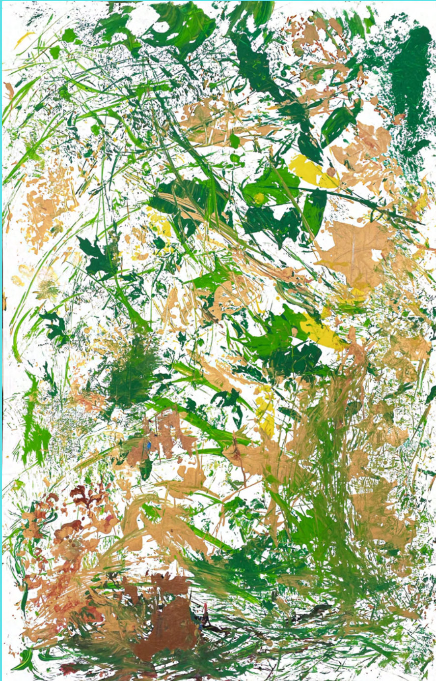
from bramble (to brushes) , May 2021

Gouache, tempera, acrylic inks, and gesso on illustration board.