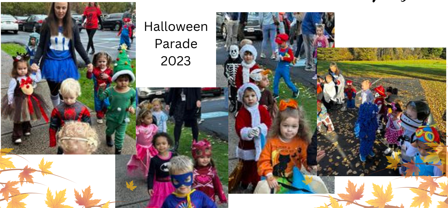
Halloween Parade 2023